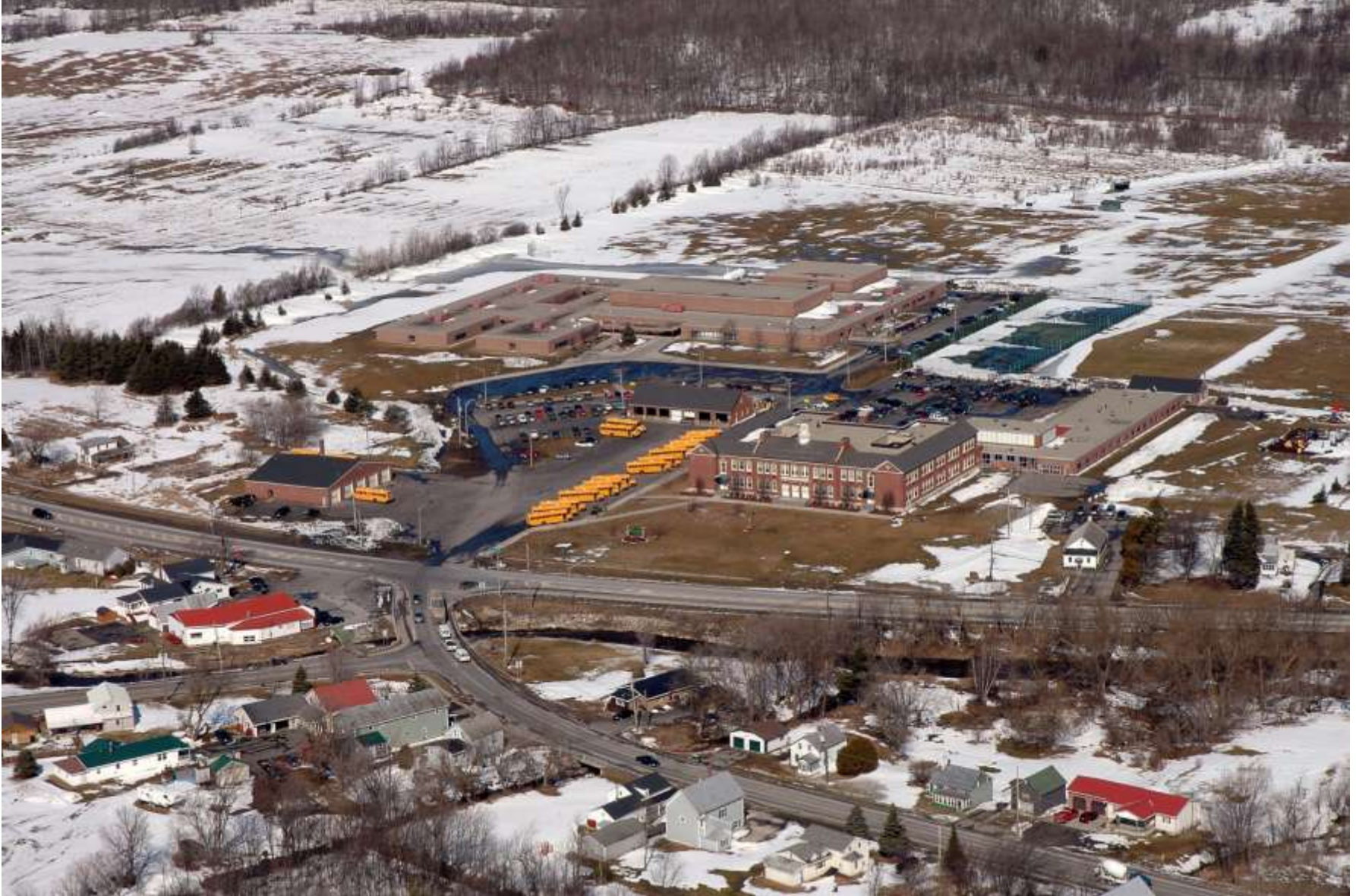
Aerial Site Photo